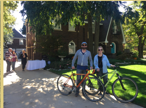
Some people cycled from home to home in the 23rd Annual Gatewood Home