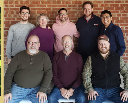
Board members at the Annual Planning Meeting