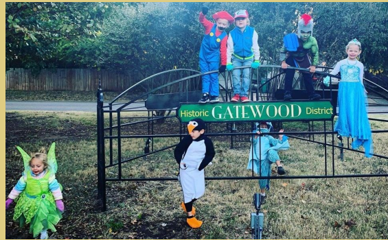
Some neighbors celebrating Halloween on the newly painted Gatewood sign in Triangle Park!

If you have neighborhood pictures you'd like to share please send them to okcgatewood@gmail.com