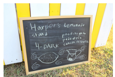
Brittani Mosley Photography photos